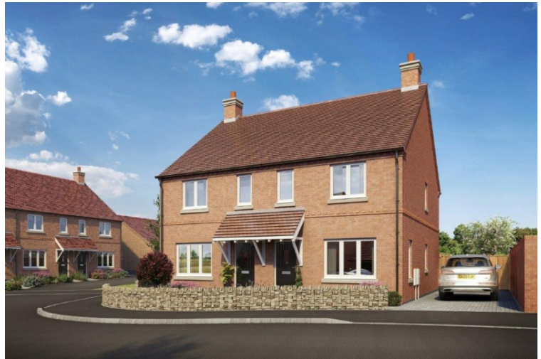
Plot 3 & 4